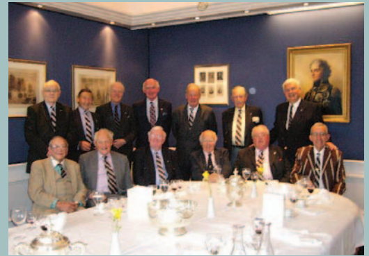
Past Presidents Lunch 2007 (above)