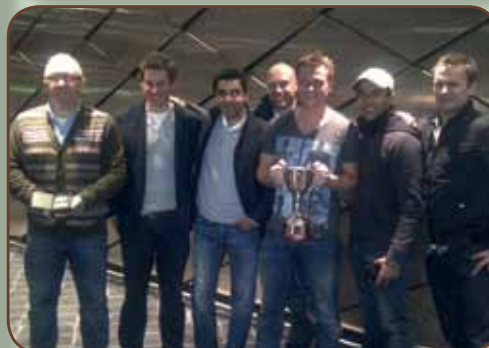
The 1st XI Millhillian Cricket team receiving the 2011 League Winners Trophy (sponsored by Saracens and presented at Wembley)