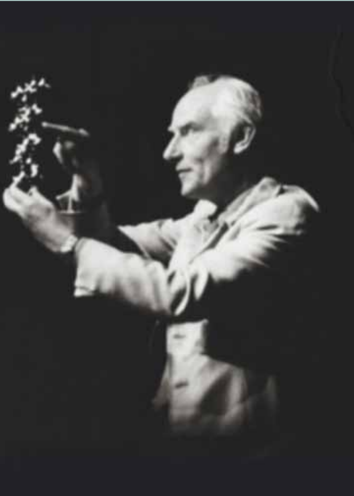
(“Francis Crick; Hunter of Life’s Secrets”, by Robert Olby, is published by Cold Spring Harbour Laboratory Press; New York)

Though I later lost touch with him I would still count him as the best friend of my youth.”