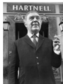
Norman Hartnell (School House 1919) He was dressmaker to the HM the Queen and the late Queen Mother. He also designed the 1953 Coronation Dress of Queen Elizabeth II.

As reported elsewhere the Old Millhillians' Room at the School was opened on Old Millhillians Day and has met with widespread approval. Hung there are photographs and biographies of significant Old Millhillians, both young and old, men and women, drawn from all walks of life. Here is a sample chosen at random of those that can be viewed there.