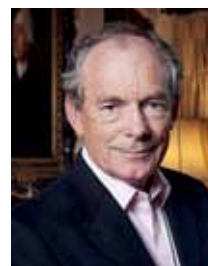
Sir Simon Jenkins (Ridgeway 1960) is a writer, journalist and broadcaster and was sometime editor of The Times and Evening Standard. He is currently Chairman of the National Trust. His writings include memorable accounts of English Parish churches.